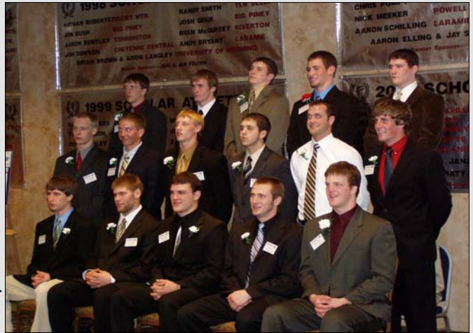
The 2007 Wyoming Chapter Scholar-Athlete Class